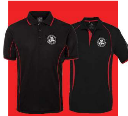
New club clothing!