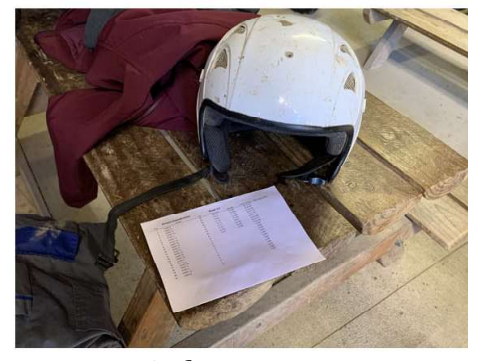
For your info...

Don't forget the AGM in the next couple of weeks...who do you want representing you...maybe it's you?