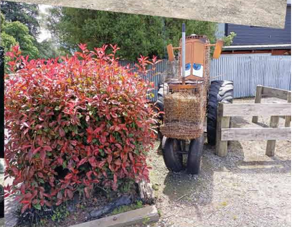
Pie n Pint