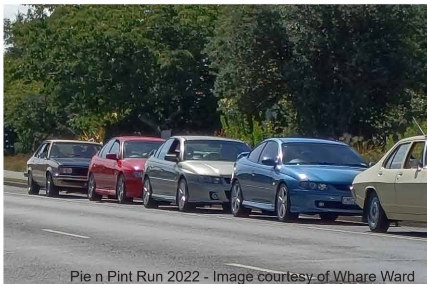
Pie n Pint Run 2022