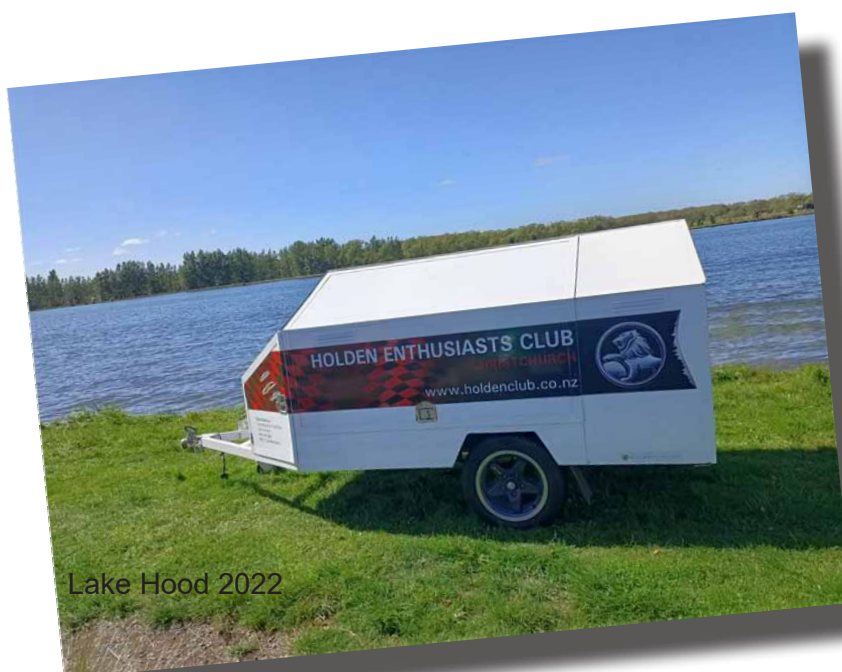
Lake Hood 2022