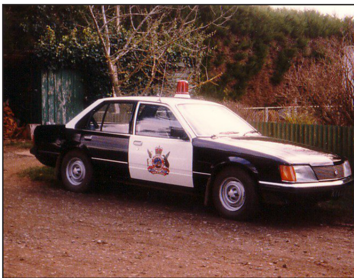
Photo of Elvira in her MOT livery