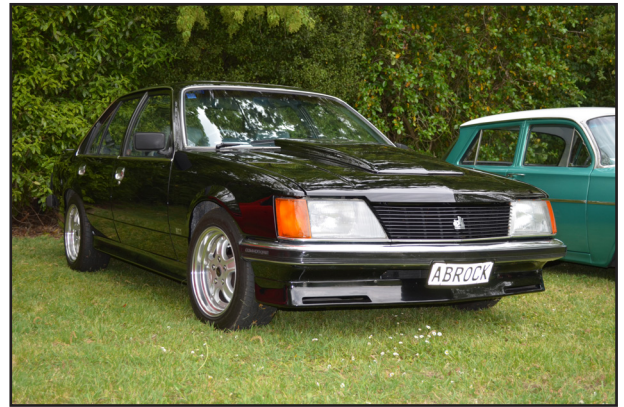
Elvira during the Annual HECC Show and Shine in November 2014,

Since we have been Elvira's caretakers we have given her a new paint job, changed the wheels back to Bathurst style three piece race wheels and tidied up the upholstery where needed but we have left the rest untouched. Unfortunately the motor needed to be rebuilt a couple of years ago, and as it was matching numbers we had the engine rebuilt. Yup, we will not give the final cost as we don't want to know ourselves! There were some minor modifications to the already hot police spec motor and now she is a huge 320hp. Not huge by today's standards however a big improvement over the factory figures.