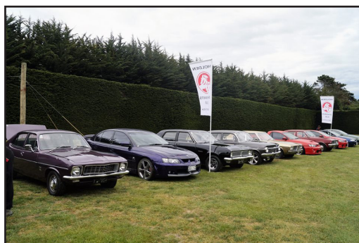
2015 All Oz Car Show HECC lineup