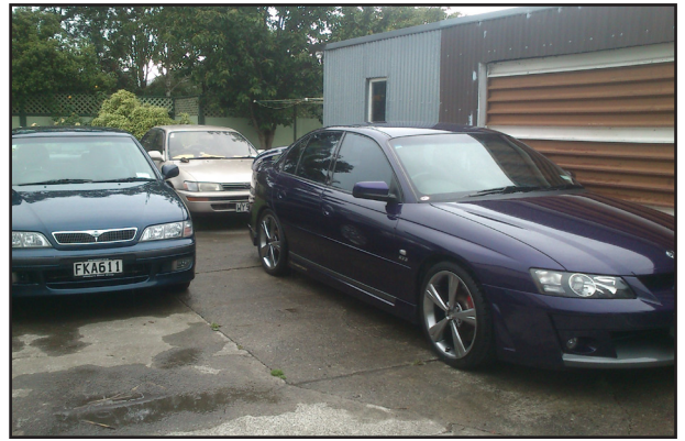
Getting reading for the drive to Taupo

Our first long distance road trip (at least, further than Seddon) was attending the 2012 annual National HSV Club Meet in Taupo (in February). This was the first time for either us travelling the Desert Road through the Central North Island. While ultimately we didn't remain members of that club for long, it was a great and interesting weekend with a decent sized number, and range of (predominantly Auckland) HSV vehicles and owners.