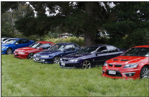
Xmas Event HECC 2013