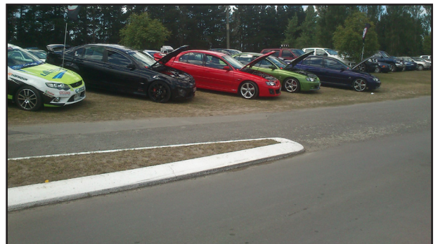
Ruapuna V8 SuperTourers 2013 part of joint display of HSV and FPV Clubs.

In late 2012 we attended our first meeting with the HECC, the annual Show and Shine at the Groynes. We quickly realised we had found the sort of club we were looking for. A local club where at the end of day the number one important thing is enjoyment of the Red Lion. Since then she has gone on many a club run, although irritatingly missed the 2014 Show and Shine at the last minute due to a cracked wheel rim. Not the first or the last time that has happened. (Most recently she stayed roadside during our Claybird Shooting Club Challenge)