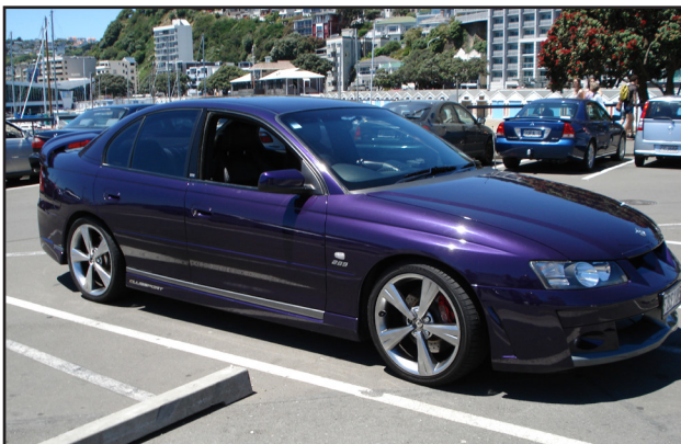
Our first photo at Wellington 2010