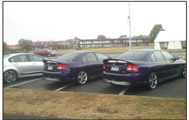
National HSV Nats 2012 Show Competition, next to a VY Murph Edition