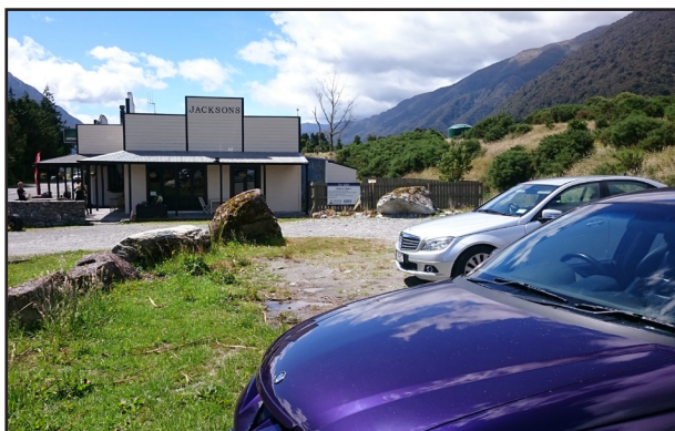
HECC Jacksons Pub Run 2015