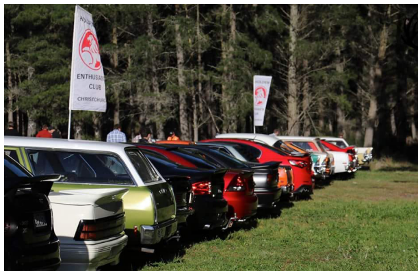
Holden park-up at the Kustoms Breakfast