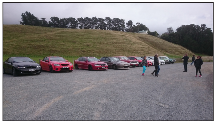
Parking up at the Wheatsheaf