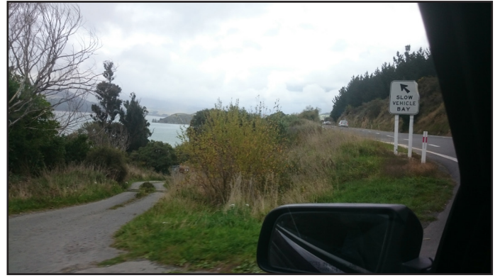
Driving around the Harbour