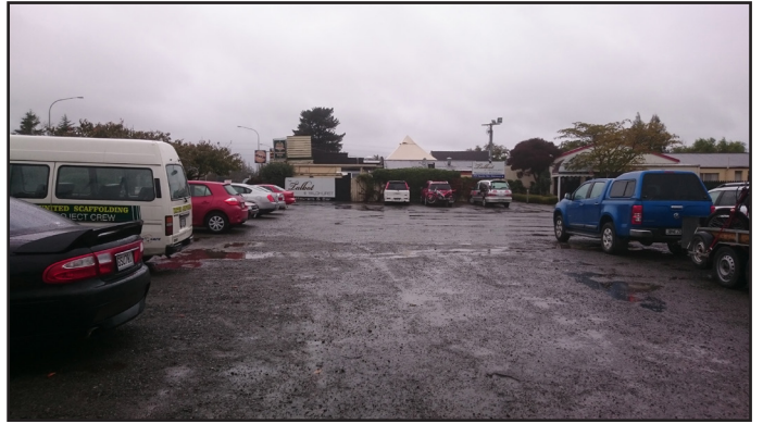
Arriving at the Yaldhurst