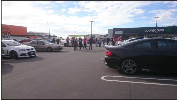
Meeting at Mitre 10 Ferrymead