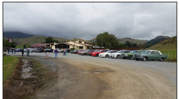
Akaroa Cruise - Plan B. Wheatsheaf Pub CLOSED!