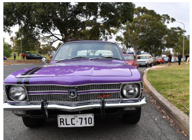
Holden enthusiasts have lined up outside the plant in Elizabeth, Adelaide.