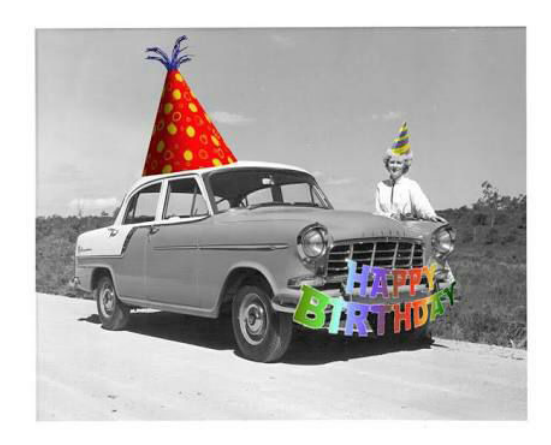
Happy 25th Birthday HECC

February was yet another busy and successful month for the club, with a good number of members and applicants making it on the run to Hanmer Motorfest and a large turnout to our March meeting.