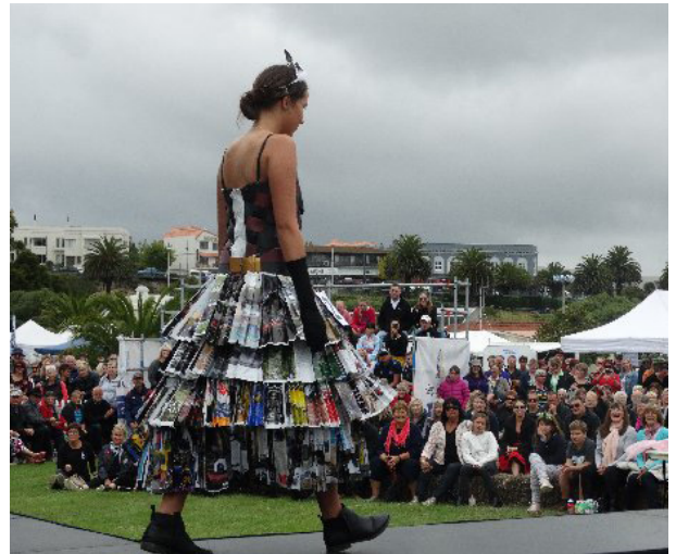
Wearable Parts Competition