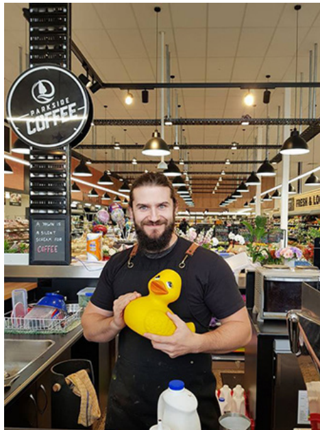
Stranger with an awesome beard!