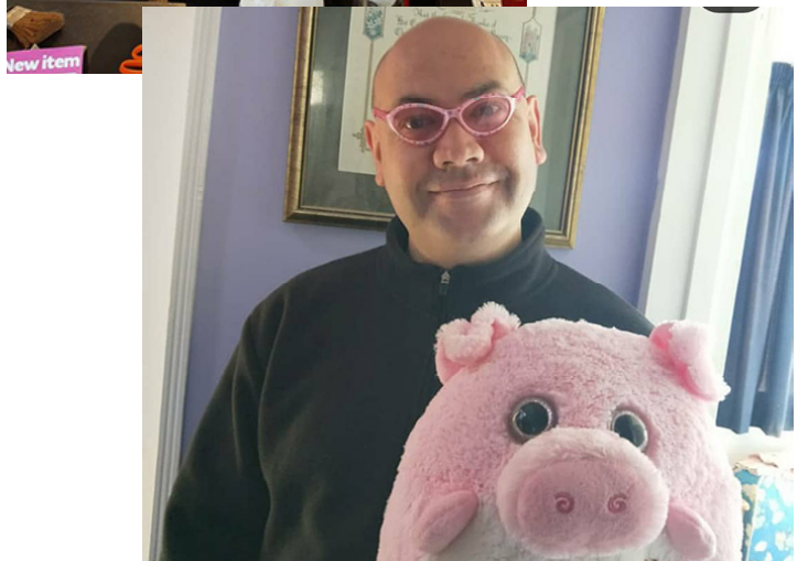
Funny glasses or normal Fuds?