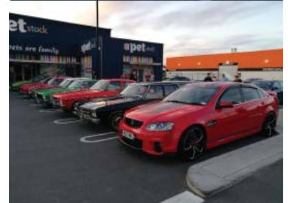
Some of the 2018 All Oz Car Show Cruise outside Burger Fuel Ferrymead