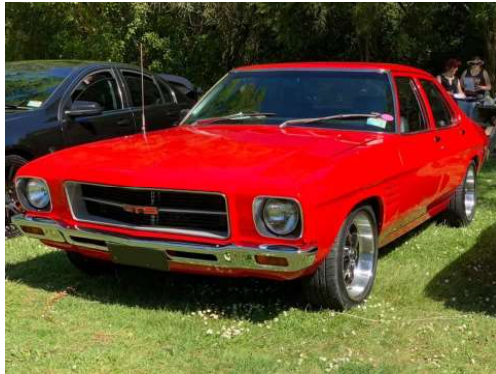
People's Choice 2019

The club BBQ was fired up and a great spread of food was prepared, a few hard luck stories as Alistair hadn't got his car back from the paint shop in time and a members wife had to come and pick up their son and backed into a park bench which was eventful as the day got on and those present had a great laugh and meal before packing up and heading home.