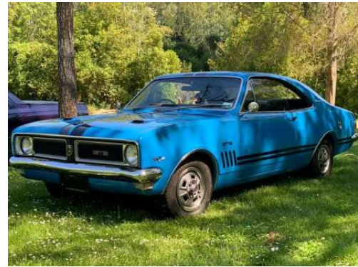
Presidents Choice 2019