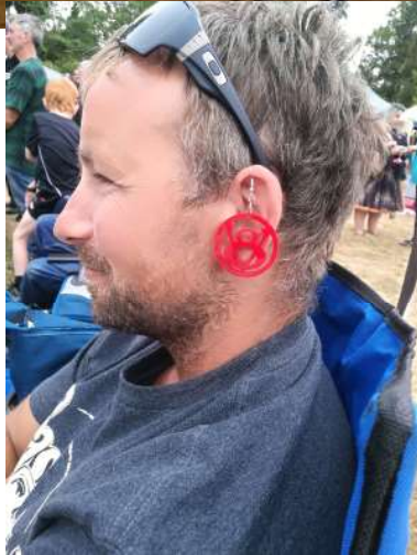
Stall Holders Choice