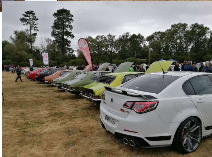
On display at Hanmer Motorfest