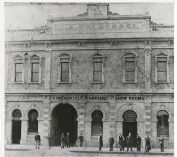
100 Grenfell Street, Adelaide