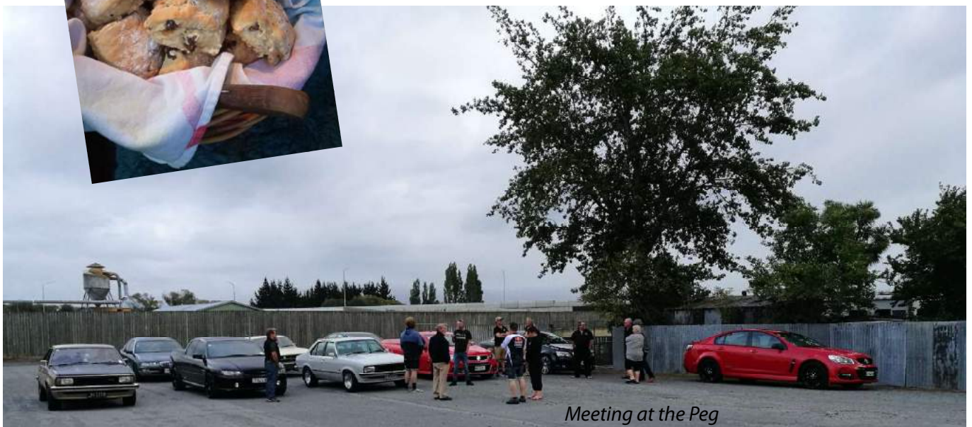
Meeting at the Peg