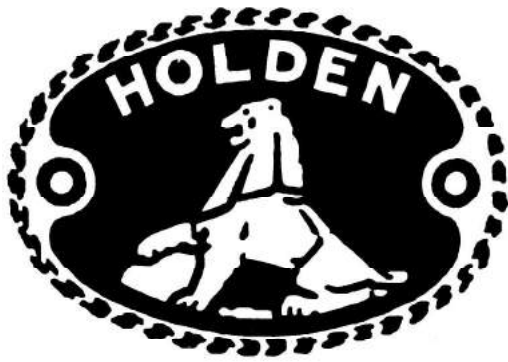
Holden logo 1928