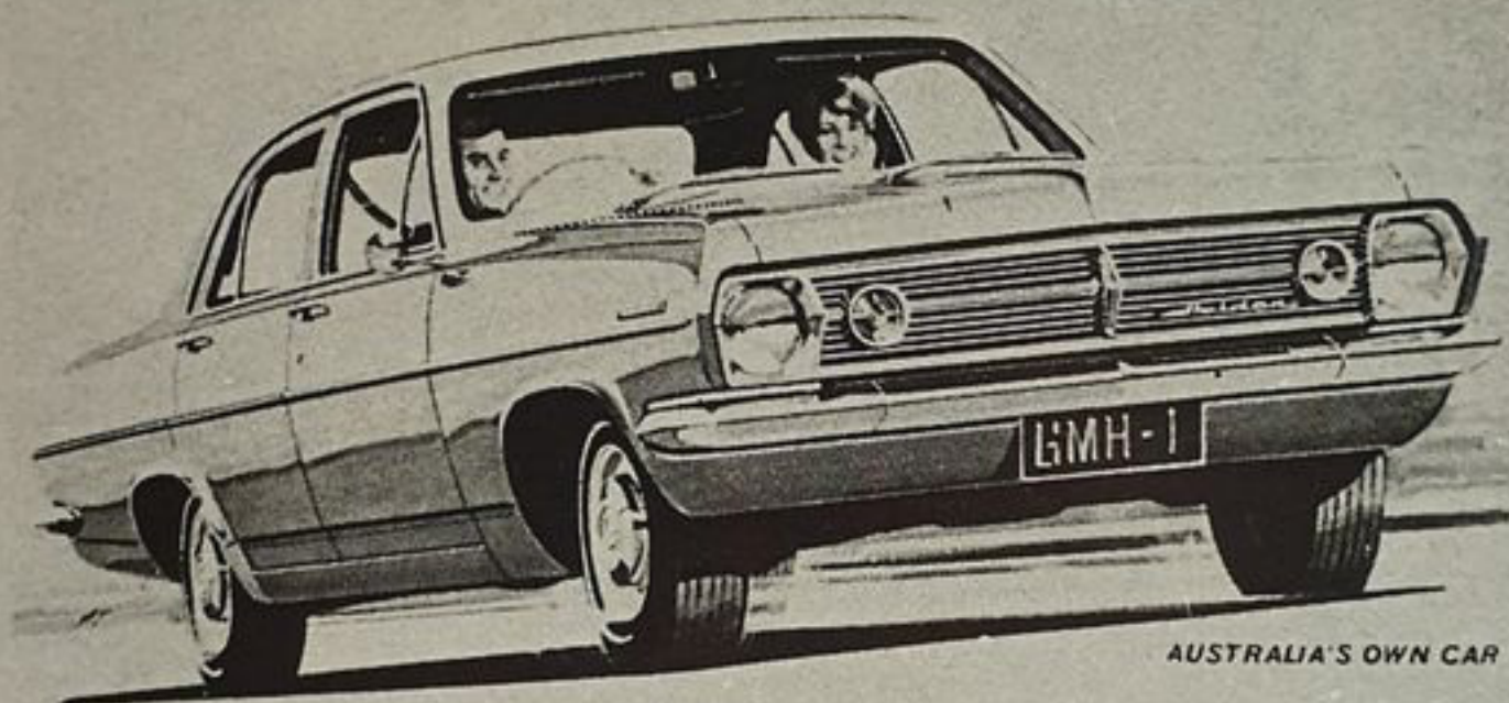
AUSTRALIA'S OWN CAR

Get rally winning performance —and save money too!